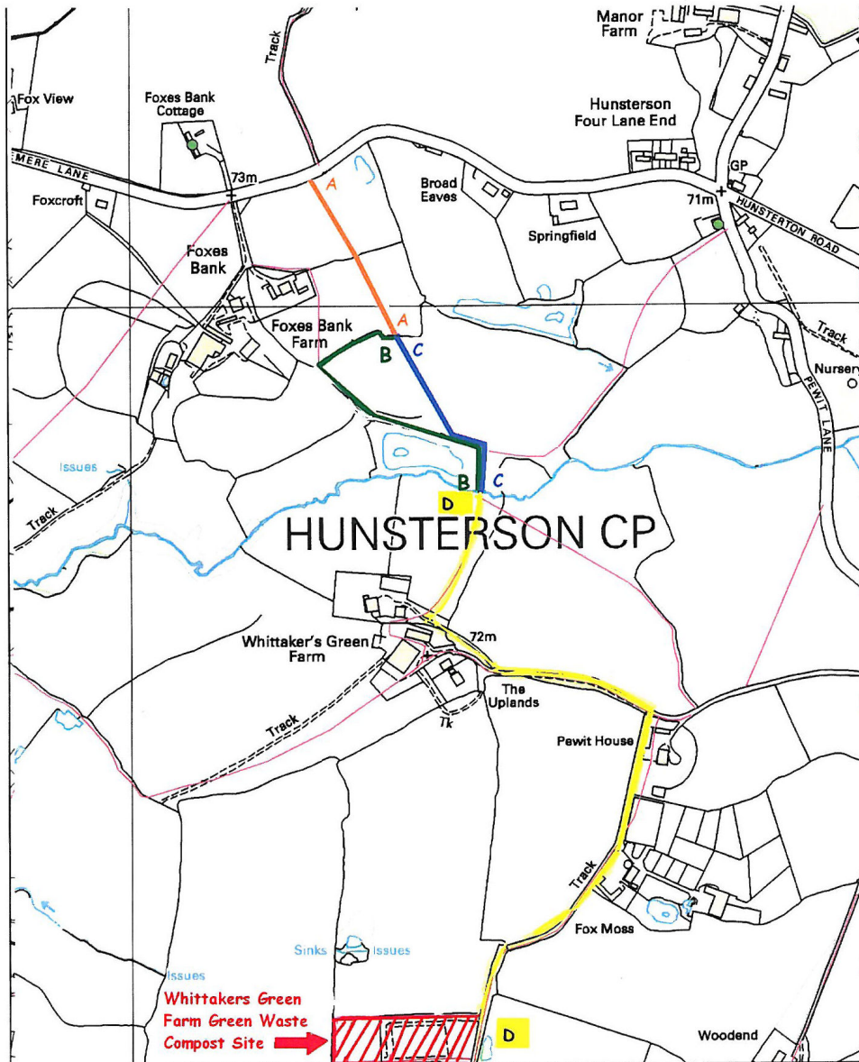
Appendix 1 – Plan Illustrating Access Tracks: consented, existing, and retrospective leading to Whittakers Green Farm Green Waste Compost Site

A—A= Consented Access Track from Bridgemere Lane (7/2008/CCC/T)